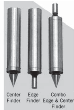
Center Finder Edge Finder Combo Edge & Center Finder